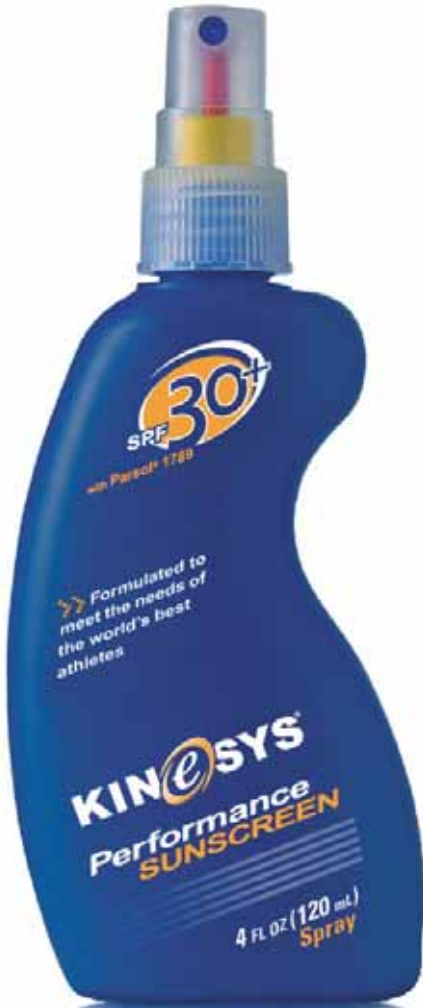
Regular Size 120ml Approx. 750+ sprays