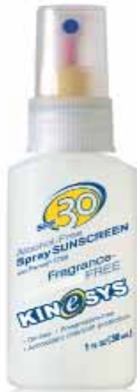
Travel Size 30ml