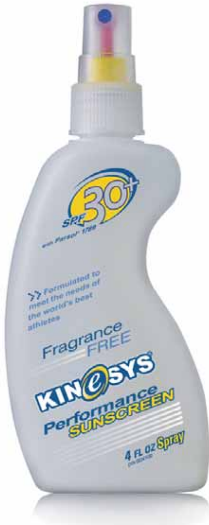
Regular Size 120ml Approx. 750+ sprays