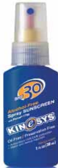
Travel Size 30ml