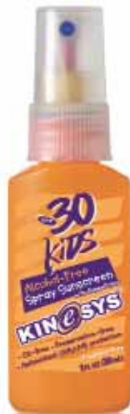
Travel Size 30ml