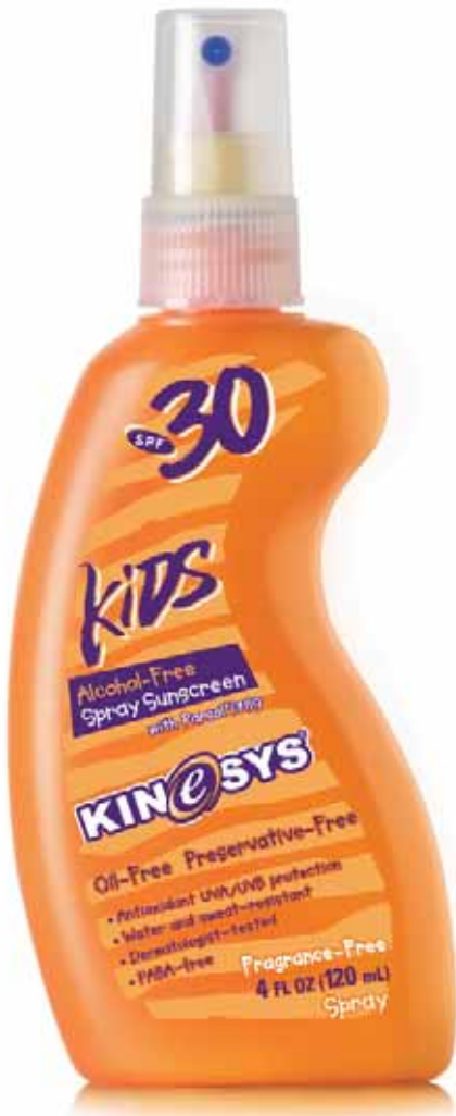
Regular Size 120ml Approx. 750+ sprays